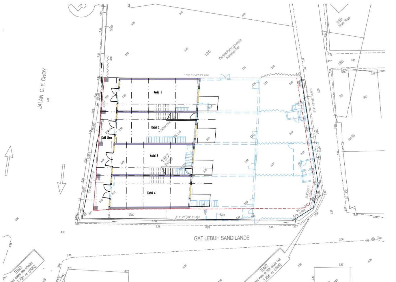
Figure 2.1.2: Site plan (NTS).

In this project, I was assigned to propose ideas and designs for the adaptive reuse of four shop houses located at Jalan C.Y. Choy, Georgetown, Penang (Figure 2.1.1). Before I started the design for this adaptive reuse, I have been taught by my colleague that all the buildings and sites within World Heritage Site (WHS) are subjected to the Guidelines for the Conservation Areas and Heritage Buildings, covering all aspects of conservation works as well as all compatible developments within the WHS. Therefore, these four shop houses in this project fall into the Category II buildings where the façade, external walls as well as the roof have to be conserved. In addition, this site is located out of the buffer zone in which there is no height limit restricted to the new built up design, however there is a plot ratio of 1:4 that has to be complied in this project.