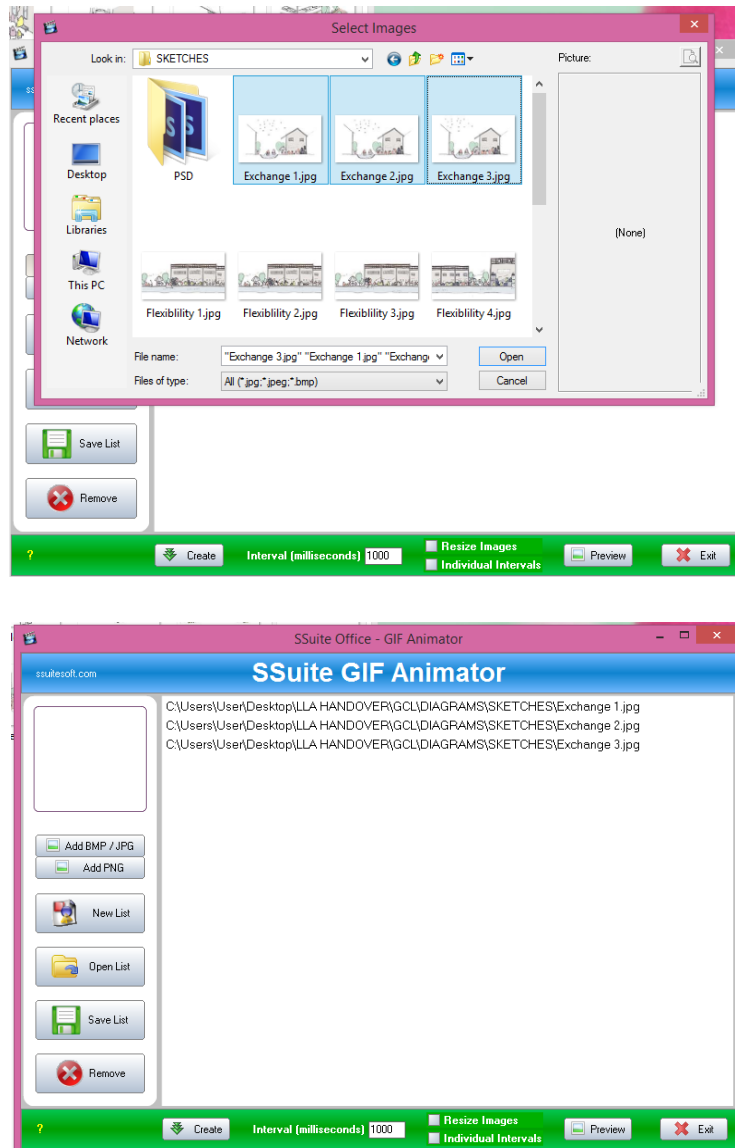
Figure 3.1.5, 6: GIF Animator used to create the GIFs.

In addition, I have explored another method to tell the stories in a more creative way by creating GIF from my sketches with the help of a software named “GIF Animator” (Figure 3.1.5, 6). All the sketches and GIFs produced are included into the presentation for the client of this project.