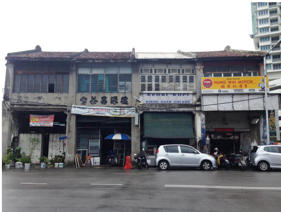
Figure 2.1.1: 4 shop houses located at Jalan C.Y. Choy.